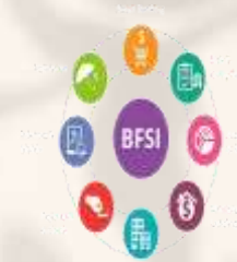
Increasing acceptance in BFSI sector