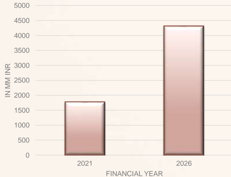
Year wise growth of DSC market - overall