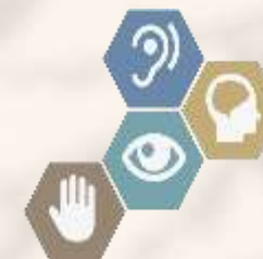
Ease of access