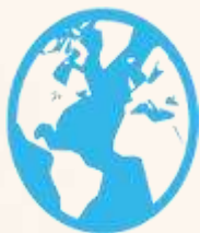
Penetration of internet